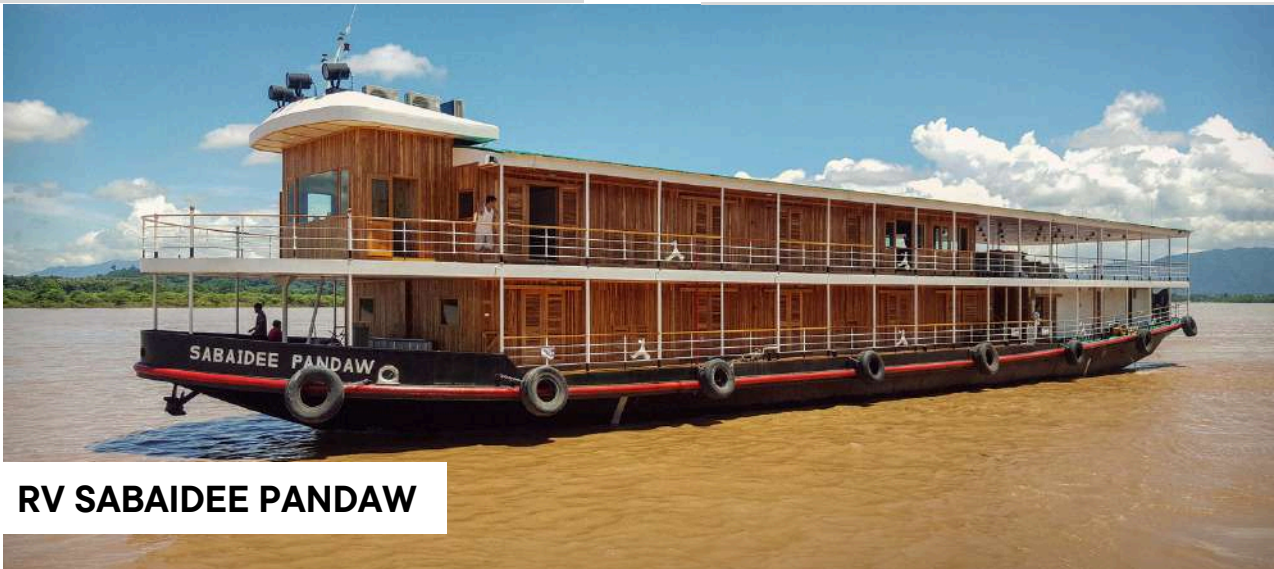
RV SABAIDEE PANDAW