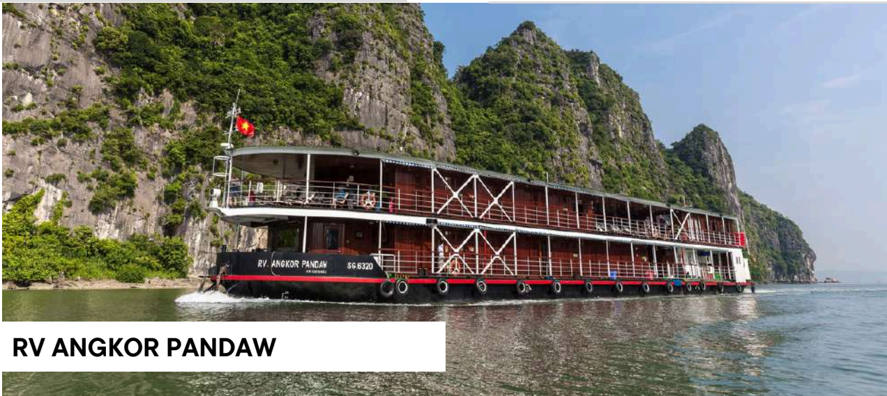
RV ANGKOR PANDAW